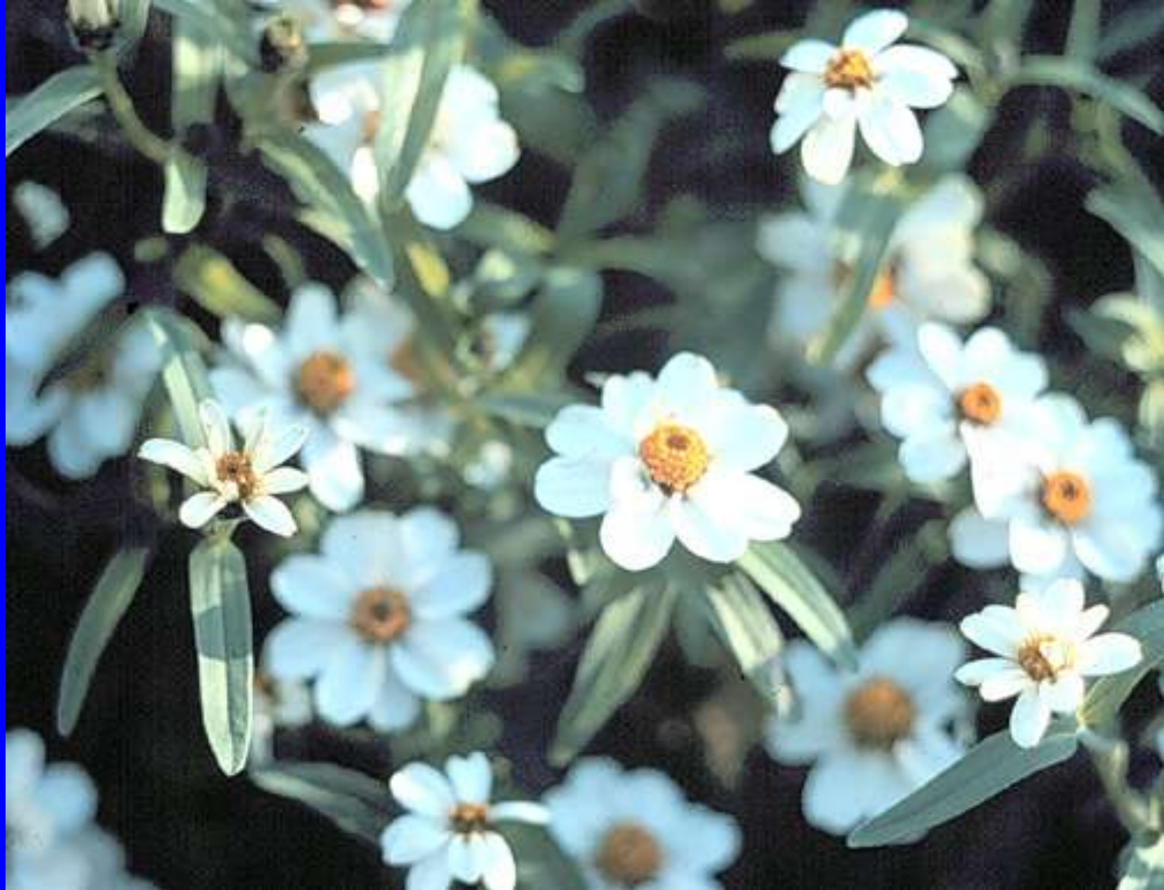
Zinnia angustifolia 'Crystal White' a 1998 Arkansas Select