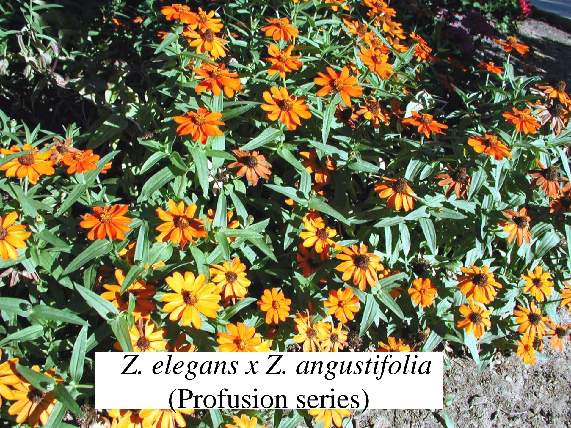
Z. elegans x Z. angustifolia (Profusion series)