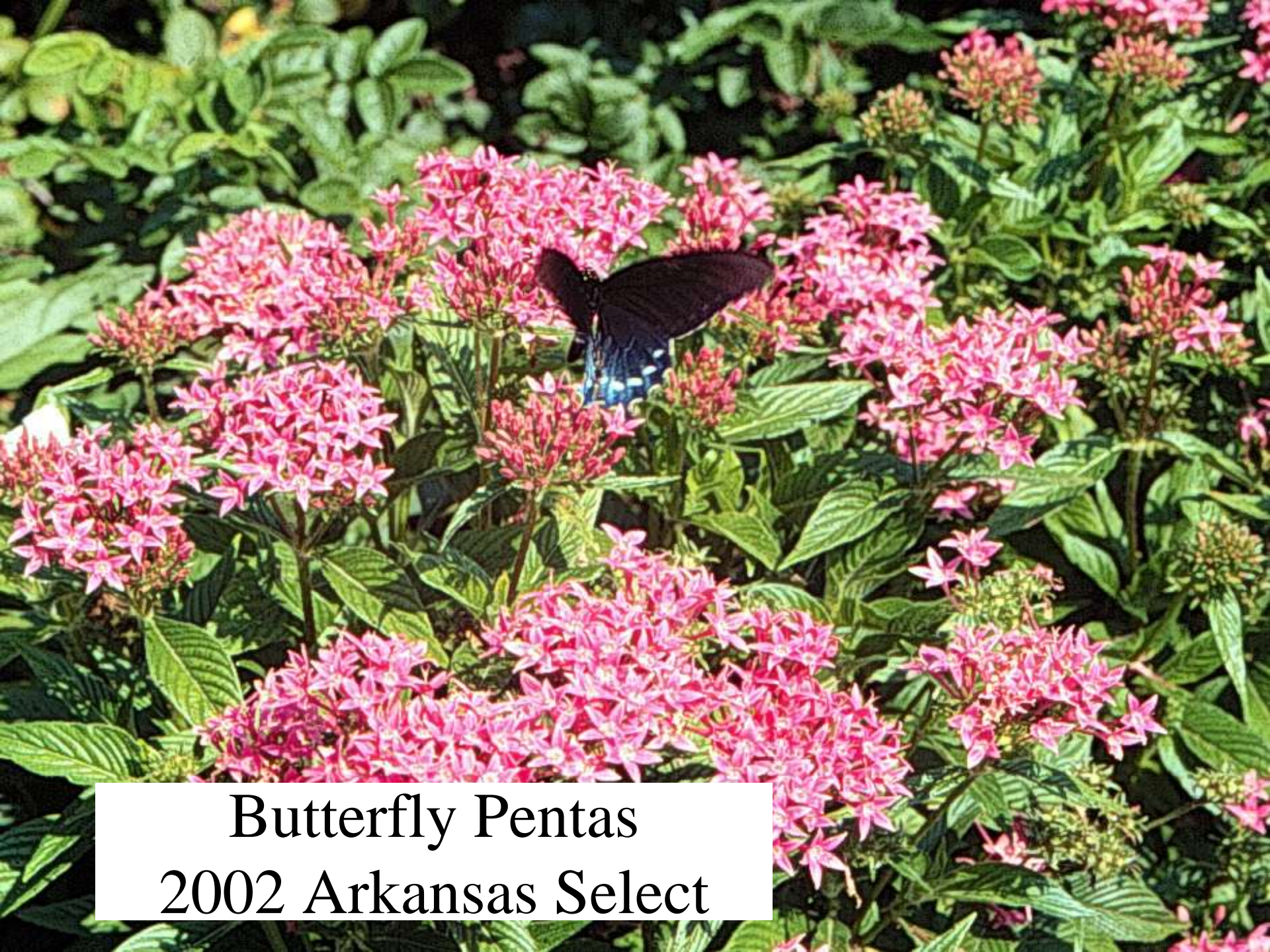
Butterfly Pentas 2002 Arkansas Select