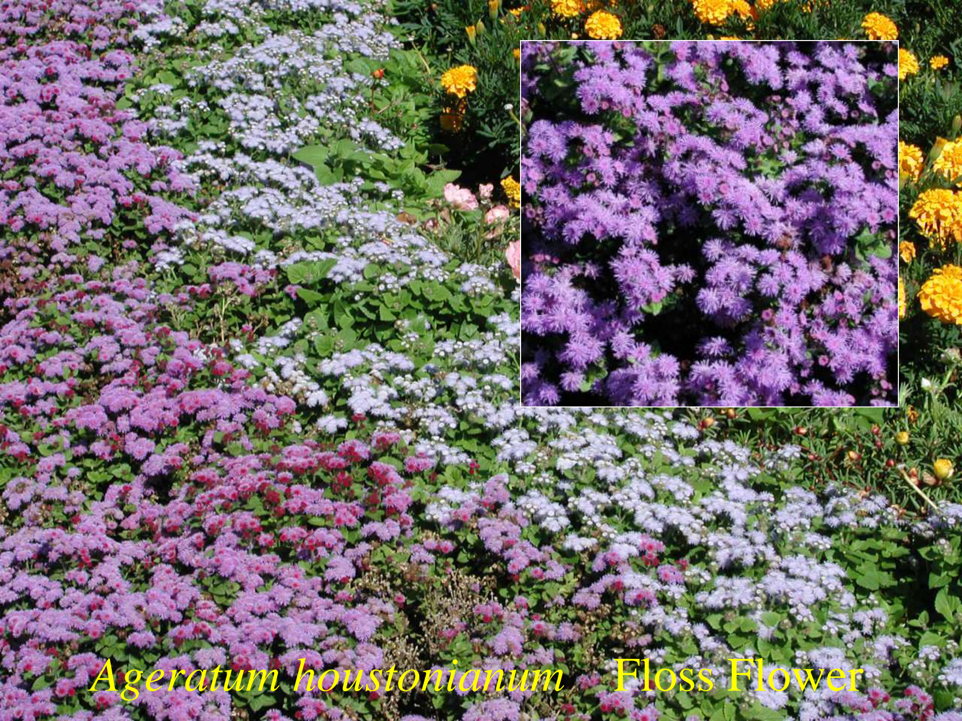
Ageratum houstonianum Floss Flower