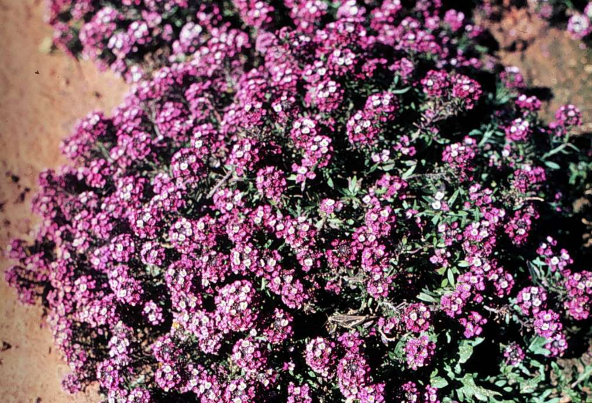
Lobularia maritima 'Rosie O' Day' Sweet Alyssum