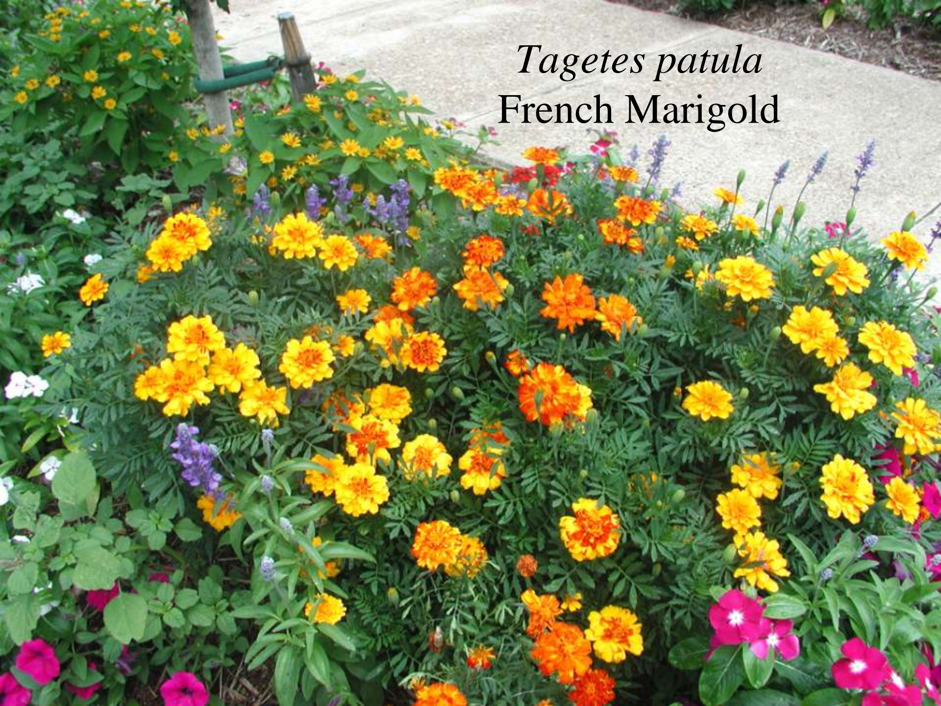
Tagetes patula French Marigold